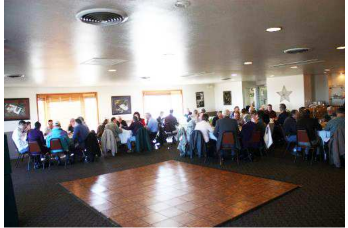
A very good turnout.