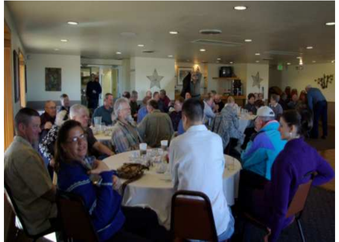
Junior and Senior Colorado Alumni Members